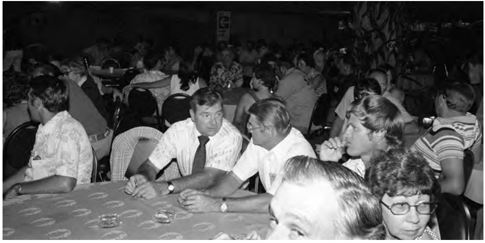
Dinner at NCGA Convention in 1977