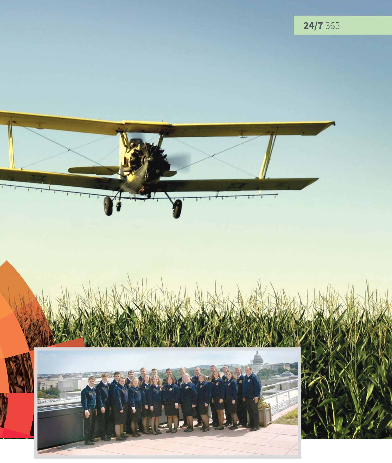
IL FFA in D.C.